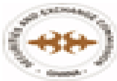
image001.png 4 KB

Securities and Exchange Commission, Ghana. 30, 3 rd Circular Road, Cantonments, Accra, Ghana, www.sec.gov.gh